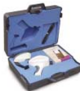
PT100 Carrying Case

Federal law restricts this device to sale by or on the order of a physician.