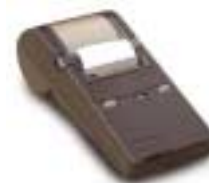
PT100 IR Printer

Call your authorized Reichert Ophthalmic Instruments Distributor today.